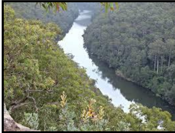
The Rock Lookout, at the end of Fairlight Road

Mount Schoenstatt is a short car trip from the World Heritage listed Blue Mountains, the Nepean River, Warragamba Dam, the source of Sydney's water supply and the historic village of Mulgoa, one of the earliest settlements in Australia.