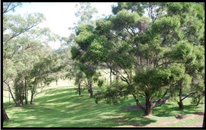
View from the Conference Hall in JKH

Conference Facilities: The Conference Hall and Sunroom, located in the Joseph Kantenich House are perfect for large group meetings. The Hall, with views across the district, seats 80-100 people in theatre style and opens into a chapel. The sunroom and adjacent kitchen is ideal for refreshment breaks but can also seat up to 35 people for small group activities. The extensive grounds also provide many opportunities for small groups to meet informally.