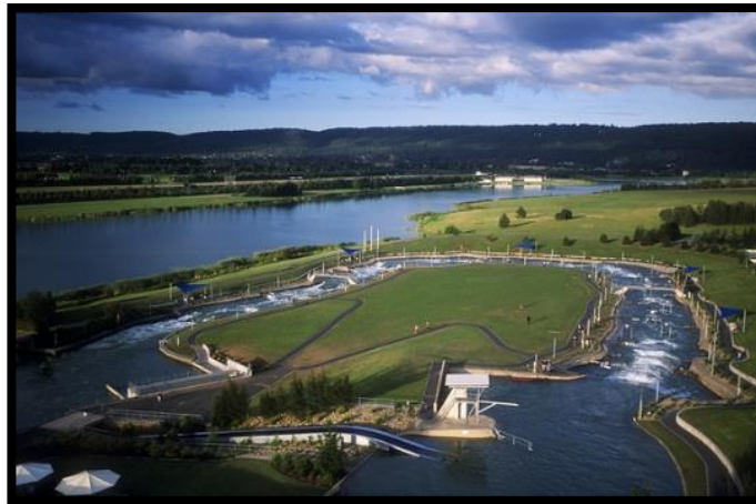
Sydney International Regatta Centre & Penrith Whitewater

It is also an ideal accommodation venue for groups competing at and visiting the Sydney International Regatta Centre and Penrith Whitewater.