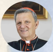
Cardinal Mario Grech Secretary General of the Synod of Bishops