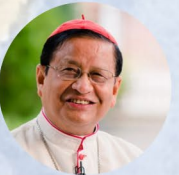
Cardinal Charles Maung Bo President, Federation of Asian Bishops' Conferences