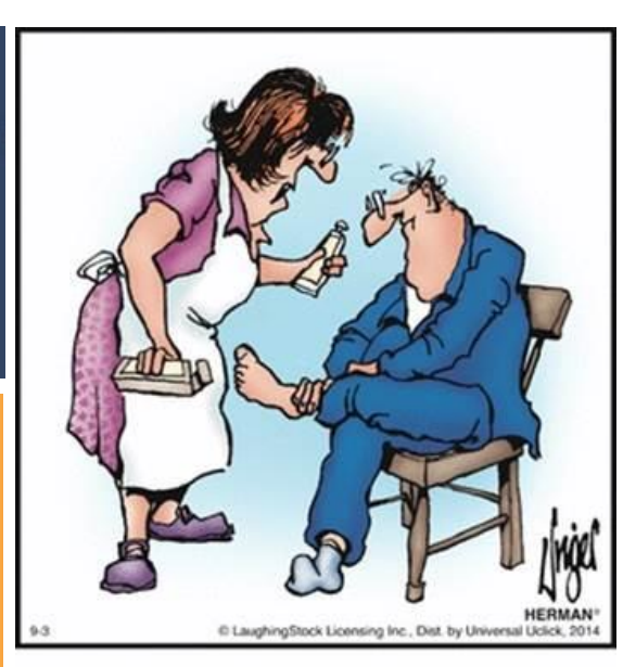
"You getting athlete's foot is about as ridiculous as a coal miner with sunstroke!"